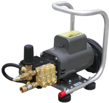
CW152A-HC Hand Carry