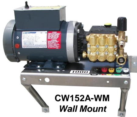
CW152A-WM Wall Mount