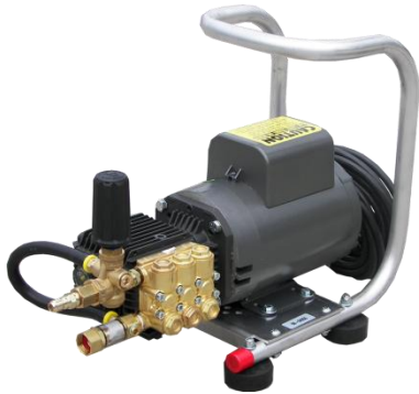
CW152A-HC Hand Carry